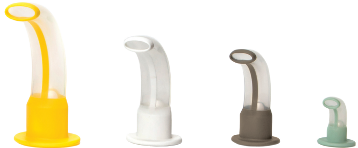
The four sizes of Intersurgical Guedel airways that have had their colours changed to conform to the updated standard.

Each department will need to consider locally how this change will be implemented, as it may take time for existing stock to be used.